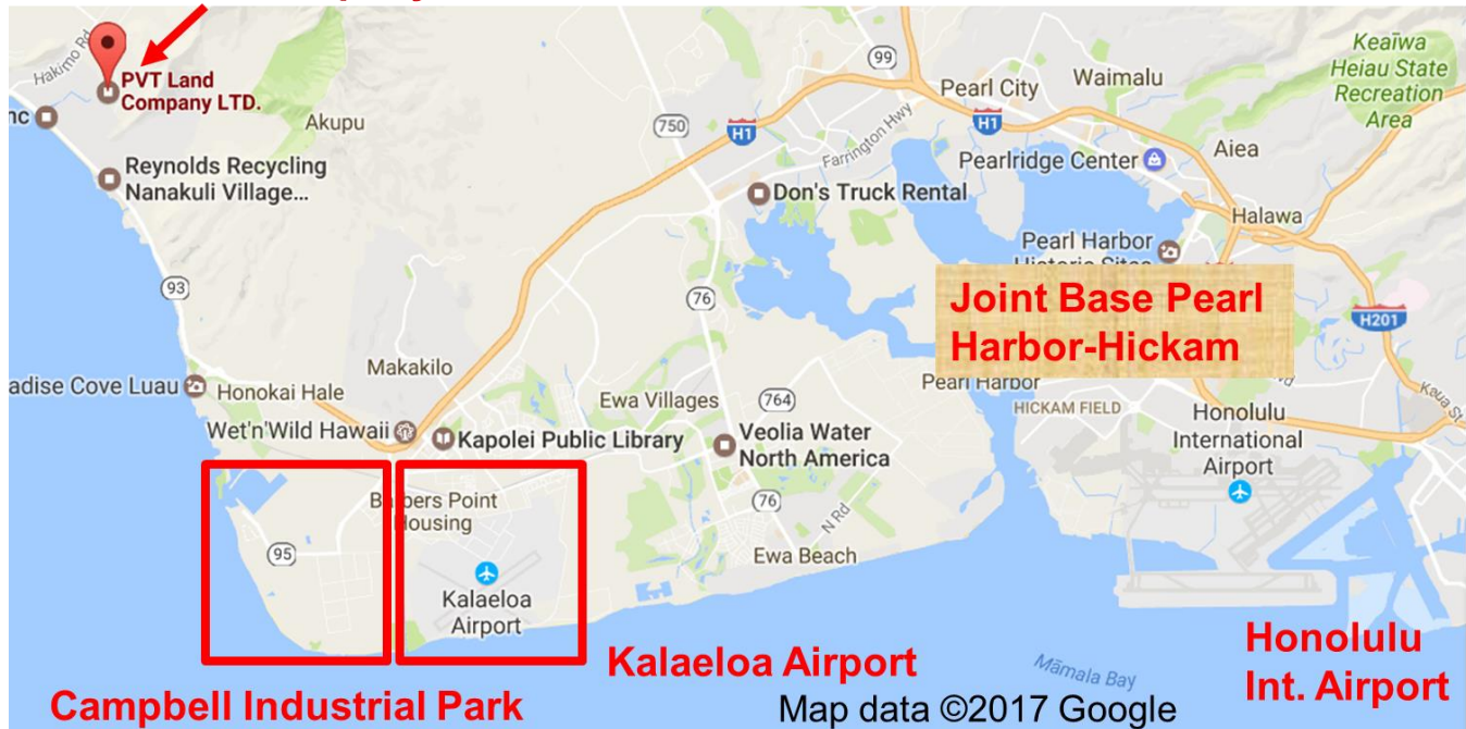
Figure 1. Possible locations of value chain participants for fiber based AJF production facility located at Campbell Industrial Park, Oahu.