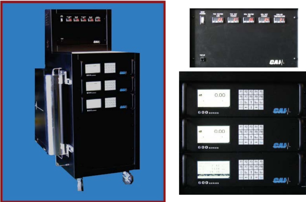
Figure 2: Portable emissions cart designed for raw exhaust measurement for engine gaseous emissions

Missouri S&T will procure a portable emissions cart designed for raw exhaust measurement for gaseous emissions such as NO/NOx, UHC, CO and CO 2 . Figure 3 shows the portable unit and the analyzers available from California Analytical Instruments (CAI). OEMs such as GE, Pratt and Whitney, and Honeywell all use gaseous emissions analyzers manufactured by CAI during the emissions tests, including certification tests.